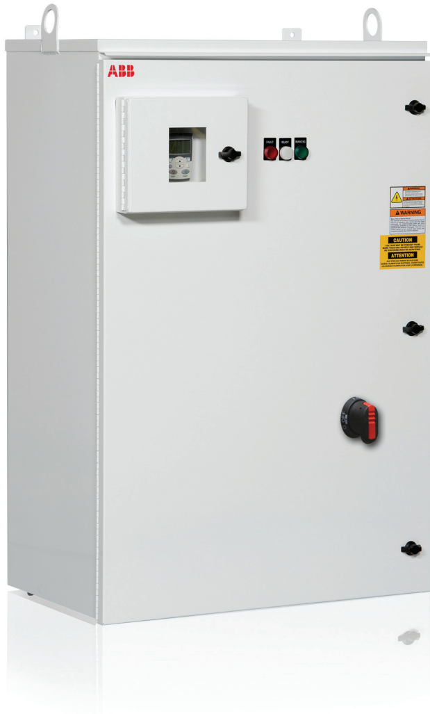
ABB drives ACS550 NEMA 3R drives, 15 to 200 hp

Easy to use drives that provide reliable pump and fan control are vital to the health of your bottom line. ABB drives help you protect your investment by safeguarding your system and enabling it to run efficiently to provide the value and dependability you demand.